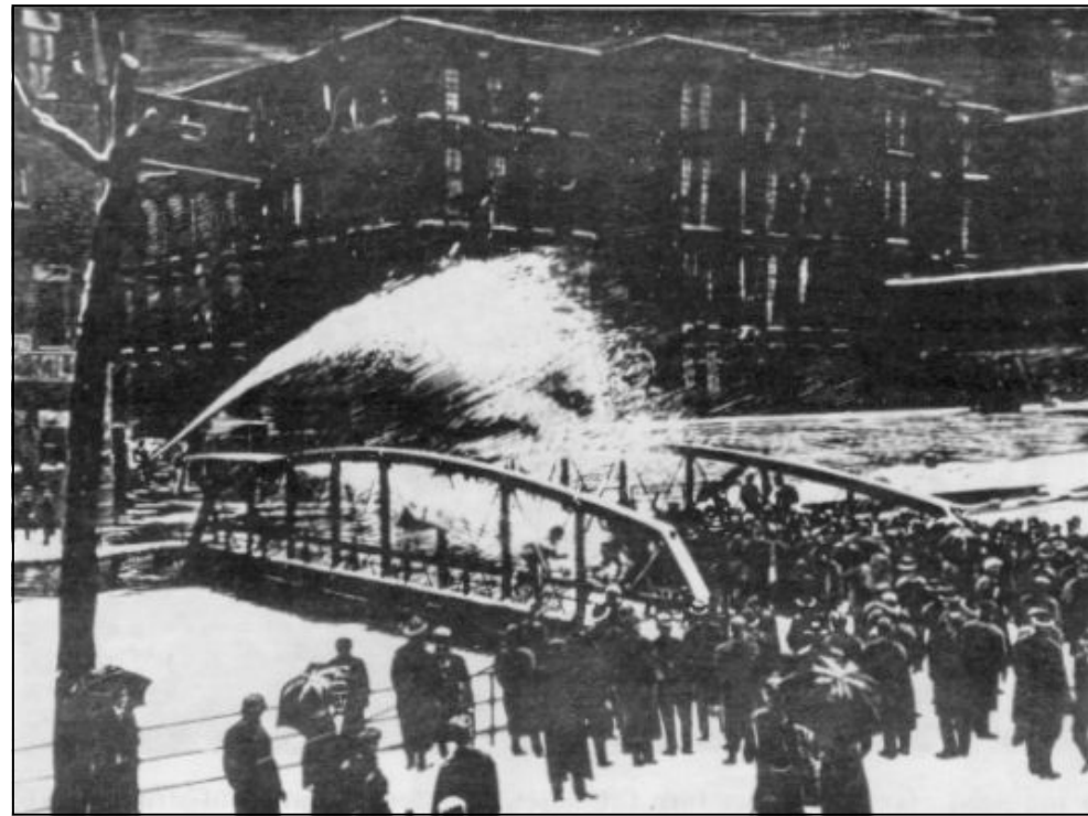
In the dead of winter, police turn fire hoses on a demonstration of striking textile workers in Lawrence, Mass., 1912.

The company deployed its guards in trenches around its property and equipped them with searchlights and