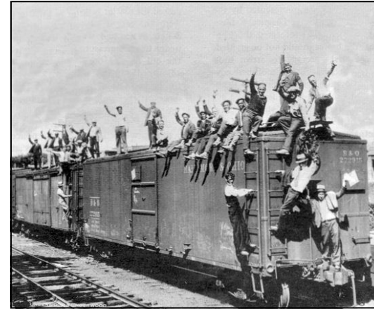
War veterans arriving in Washington for the bonus protest. Sympathetic train crews helped them along the way, sometimes billing the ex-soldiers as "livestock."

The first state police force in the country was formed in Pennsylvania in 1905. Many people saw the Pennsylvania State Police as a direct replacement for the Old Coal and Iron Police, a disorderly private force paid for by those two