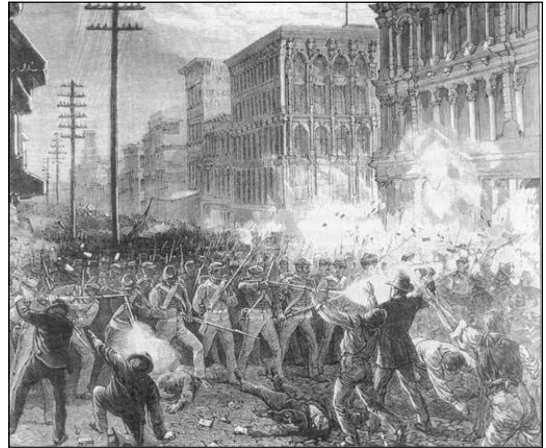
Seattle 1877: Federal troops confront railroad strikers

Between Wall Street bankers and the Pentagon brass there is a merging at