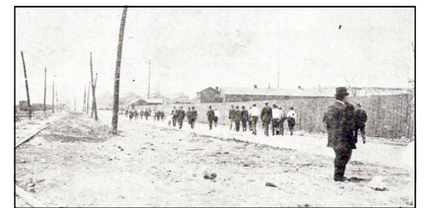
McKees Rocks, PA, 1909--Stockade and armed guards at Pressed Steel Car Co. plant during strike.

With the example of Pennsylvania to follow, Massachusetts and other states soon established their own police forces. The establishment of these paramilitary forces did not put an end to the role of the National Guard in labor disputes. What it did, though, was to give governors a more flexible way to respond to labor crises. The state police could be used before a situation met the legal conditions of an insurrection, and the spectacle of forcing men back to work at bayonet point could be avoided. By having on hand this extra force of trained men, the states also avoided the practice of deputizing large numbers of questionable "volunteers," whose behavior, as in the Pullman strike, was sometimes just as much a problem for the authorities as that of the workers.