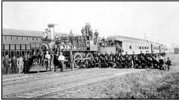
Federal troops at Pullman, 1894

nois is not only able to take care of itself, but stands ready today to furnish the Federal Government any assistance it may need elsewhere." Troops were also sent to Kansas, Colorado, Texas and Oregon, and their governors made similar protests.