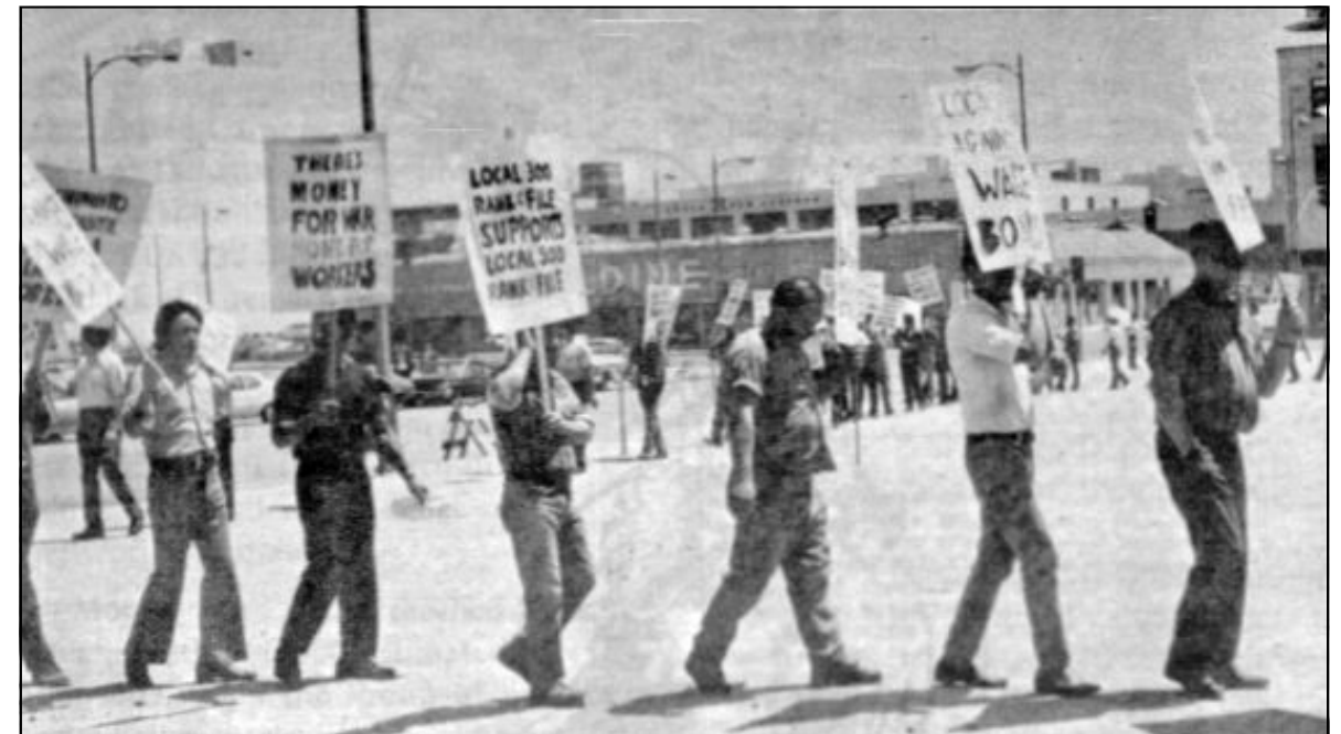
500 Chicano workers demonstrated against the Pay Board--Los Angeles, 1972.

As they did in the Depression of the 1870s and 1930s, the big industrialists and bankers are trying to unload the burden of their economic mess on the backs of working and poor people.