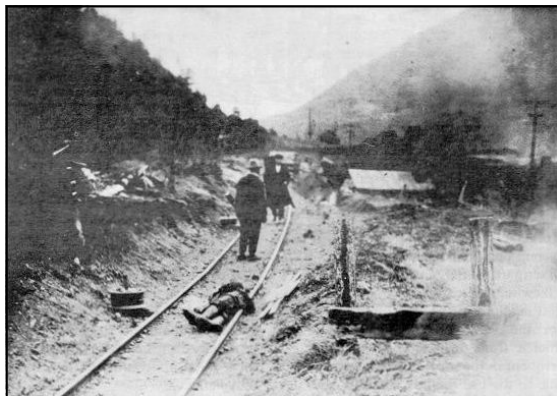
An armed striker stands near the slain body of a fellow miner gunned down by company goons in Forbes, Colo. during the Ludlow Strike.

machine guns. Detectives hired from the Baldwin-Felts Agency sped around in an armored car which the strikers called the "Death Special." From this vehicle the hired police took pot shots at likely targets. Over the past two years the company had stocked $30,000 worth of arms, and now it put them to use.