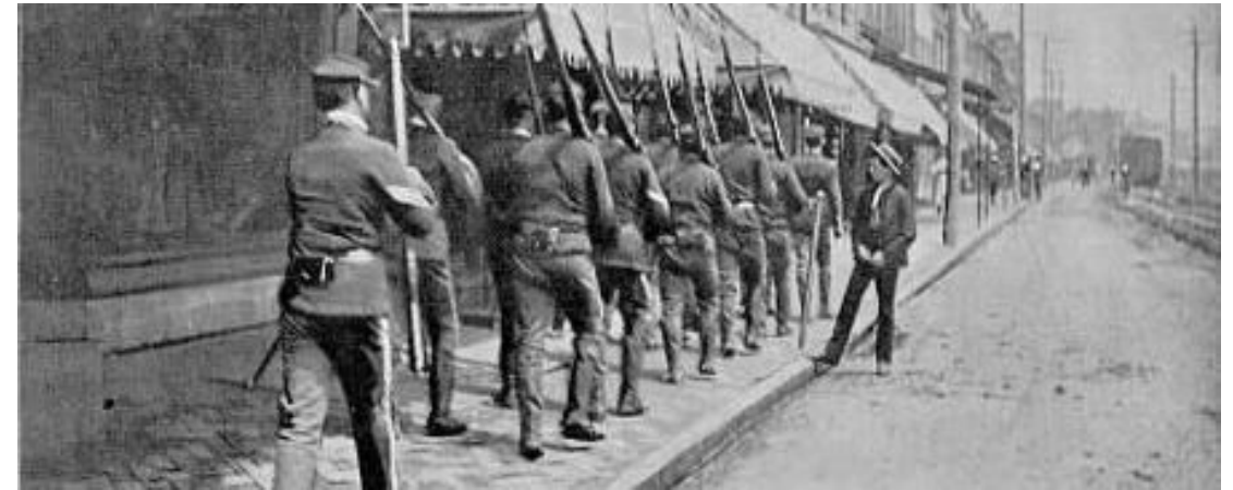
Pinkerton guards in Homestead, PA, 1892

By Wednesday, the strike everywhere had crumbled, though pockets of resistance continued in New York for the rest of the week. The last troops were withdrawn from the city on Monday, March 30.