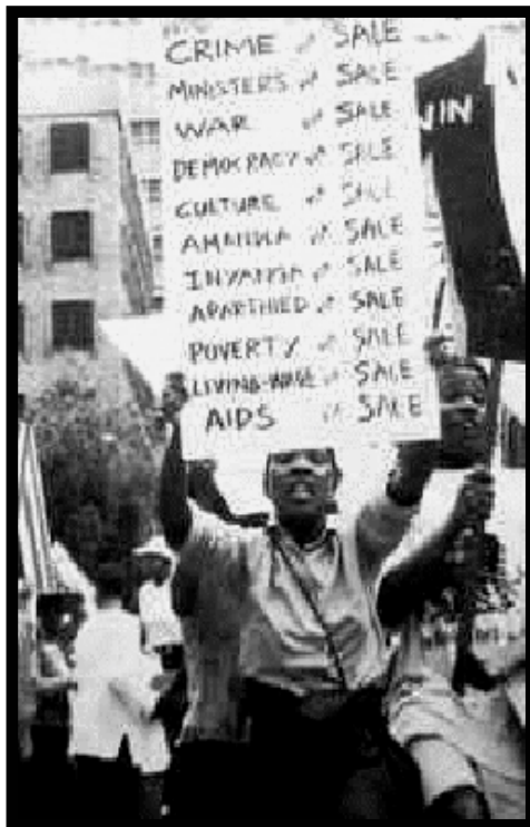
CLEARANCE SALE IN PRESENT-DAY S. AFRICA: Protest modern-day style. 15 years ago the commodity and commodity relations encompassing the virtual totality of everyday life would never have been so emphasised in South Africa where everything from, culture, crime, democracy to apartheid is now merely a marketable item.

So, while most of the wealth still remains firmly in white hands, the optimistic black middle class, undisturbed by visible proletarian subversion, can claim “rich people have worked hard for their money, it wouldn’t be fair to take it away from them” ( Guardian , 25/5/04). At the same time, those rich white supporters of apartheid who fled the country 10 years ago are now being encouraged to come back – all is forgiven: advertisements on satellite television will be backed later this year by an international road-show of seminars and exhibitions urging expatriates to return to a land of sunshine and opportunity, as part of the “Homecoming Revolution,” sponsored by the First National Bank. As Pamela Cox, former Head of the South Africa